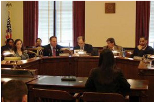
New Jersey State Government Committee hears a Falun Gong practitioner's testimony

(Clearwisdom.net) The New Jersey State Government Committee held a public hearing on April 14, 2007 at the State Assembly Building on motion SR71 condemning the Chinese Communist Party (CCP) harvesting organs from living Falun Gong practitioners. A number of New Jersey Falun Gong practitioners and representatives from non-governmental organizations provided testimony. Five senators on the committee unanimously adopted the motion after the hearing was over. They will submit the motion to the state senate for all senators to vote on.